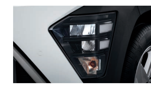
LED Headlamps (MFR)