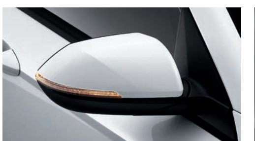
Outside mirror (Heated / Folding / Turn signal indicator LED)