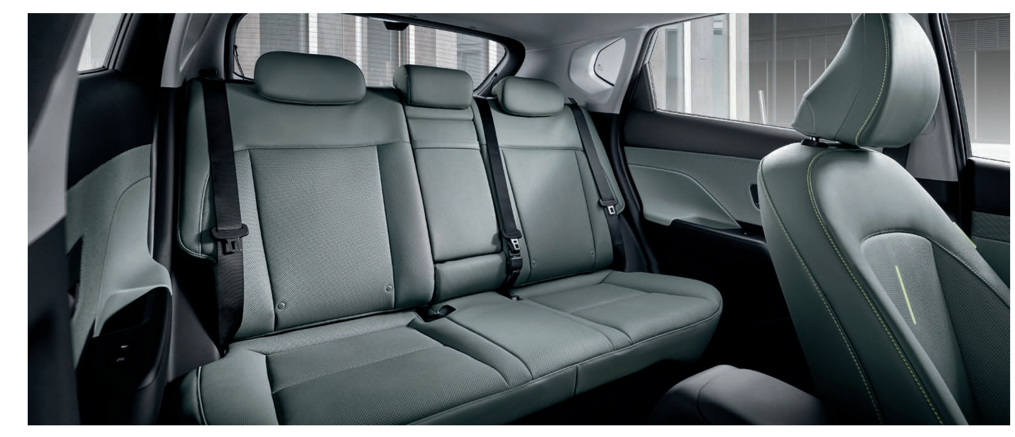
2nd row space

*This interior colour is not available and is for illustrative purposes only. Black Cloth will come as standard on KONA Petrol and KONA Hybrid models.