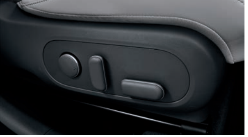
Powered driver seat