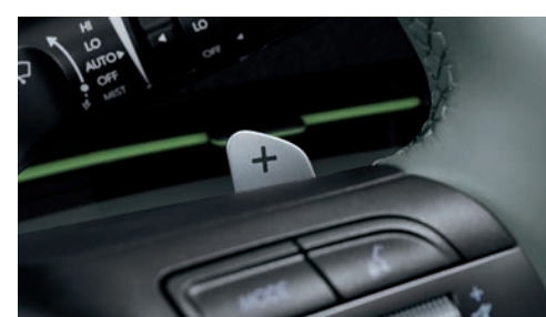
Paddle shifters* *Only available in KONA Hybrid