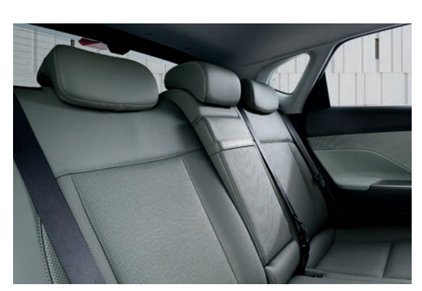
2nd-row seatback 2-step latch