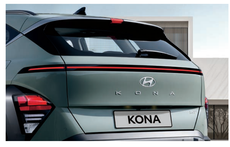
Spoiler Integrated HMSL, rear seamless horizon lamp LED brake lamps, LED turn signal lamps