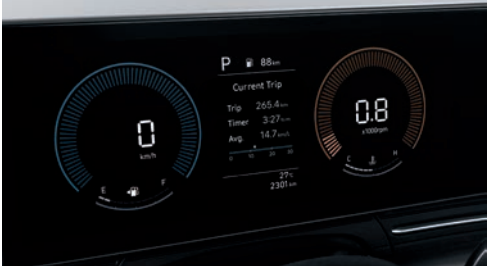
Cluster display (4-inch color LCD)* *Only available in Signature model