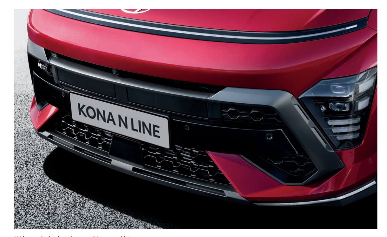
N Line-exclusive front bumper & bumper skirt

The N Line exudes boldness and dynamism, featuring a high-performance exterior design inspired by the renowned high-performance N.