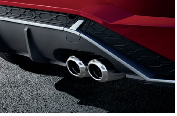
N Line-exclusive single twin tip muffler