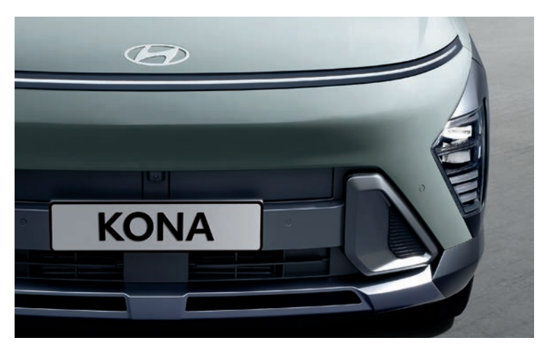
Front seamless horizon lamp, front bumper* * Only available in Kona N Line model