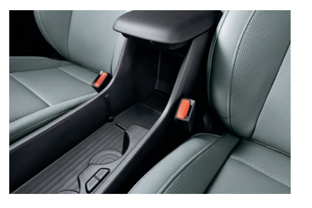
Open console storage (removable bulkhead / rotational cup holders)