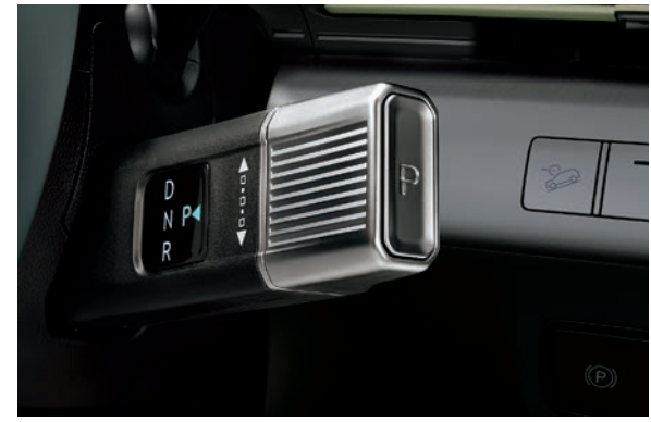
Column-Type Shift by Wire (SBW)* *Only available in Kona Hybrid model