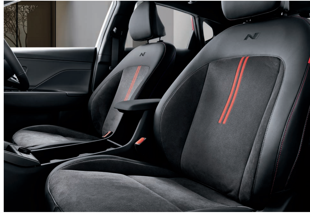
N Line - exclusive seats *All images shown are for reference only