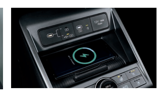
USB-C Data/Charging ports/Wireless charging pad* *Wireless charging pad only available in Elegance model upwards

* Features and specifications may vary by market and are subject to change. Please consult your local dealer. 25