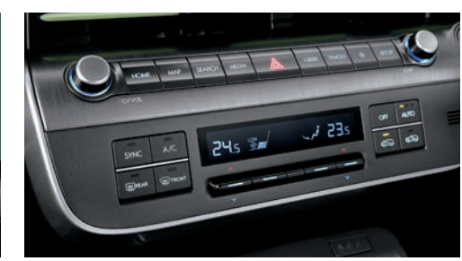
Full auto air conditioning system