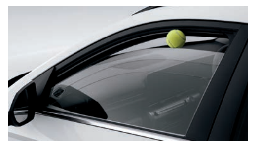
Safety power window