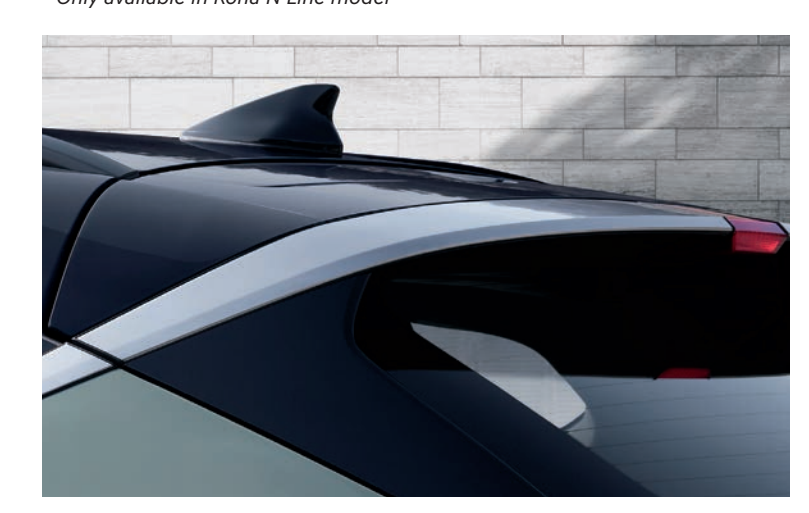
Dual tone roof, sharp connecting chrome line