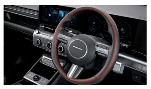
Heated steering wheel *Only available in Elegance model upwards