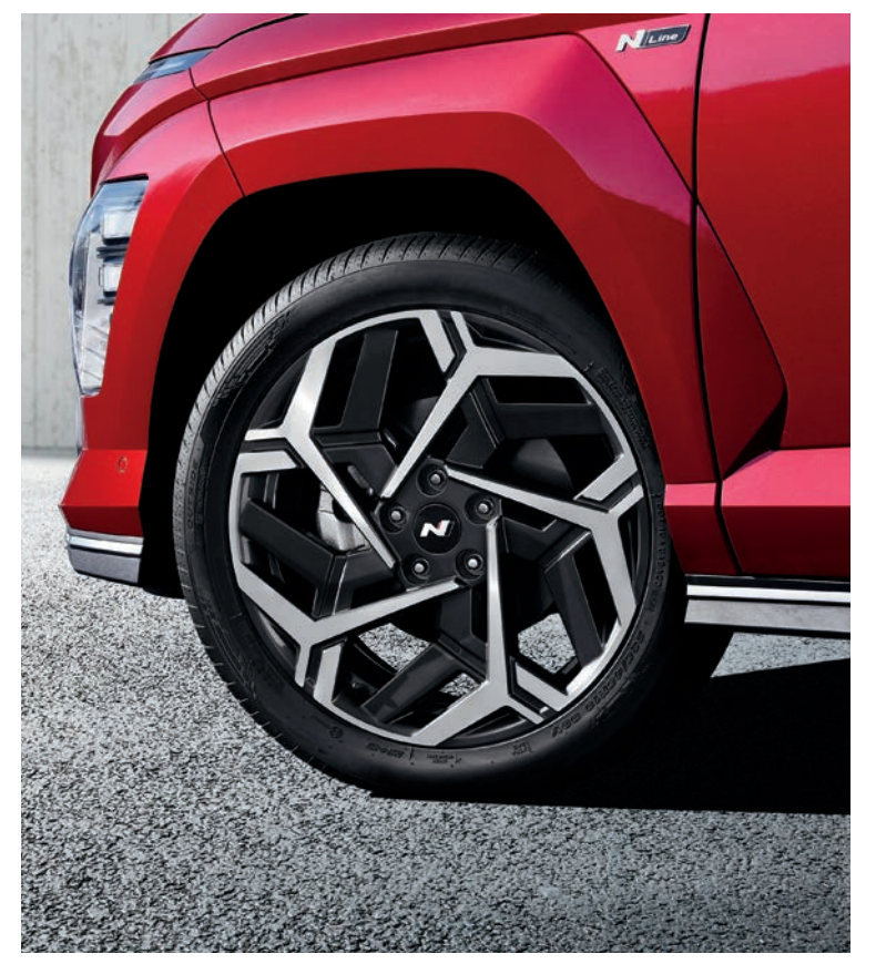
N Line-exclusive 18-Inch alloy wheels / Body-colored cladding