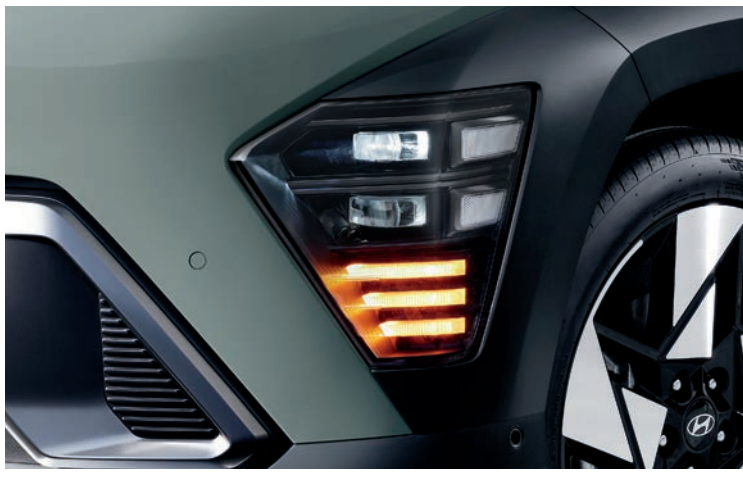
Full LED headlamps (projection type)