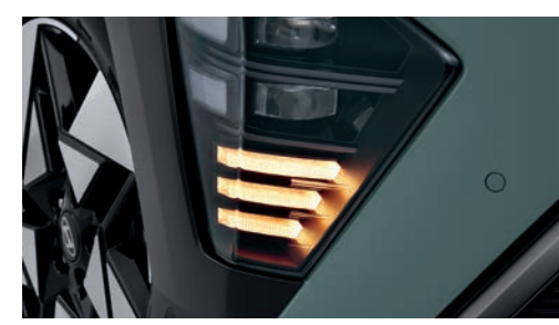
LED turn signal indicators (front/rear)