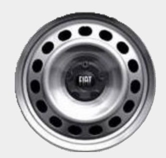
16" steel wheels with half hubcap