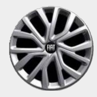
16" black steel wheels with fullsize hubcap