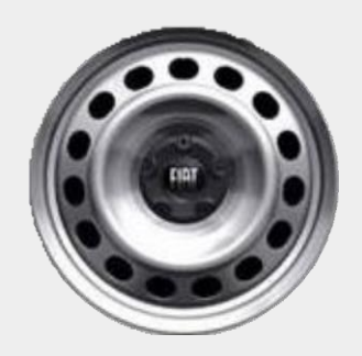
15" steel wheels with half hubcap